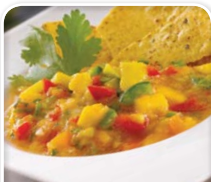
Perfectly chop ingredients